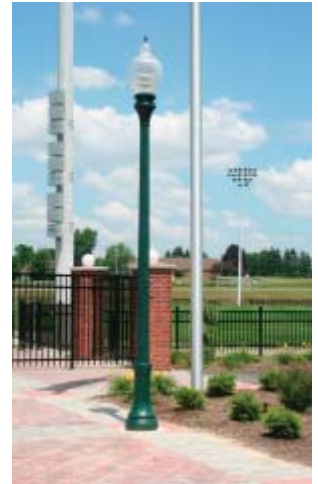
Emmitt Field at Holmes Stadium