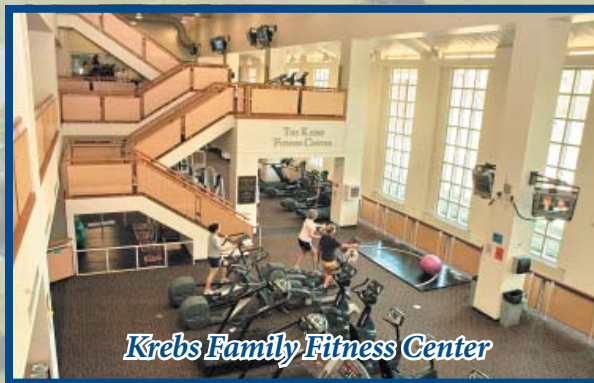
Krebs Family Fitness Center