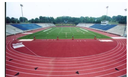
Christy Mathewson Memorial Stadium Home of the Bucknell Bison