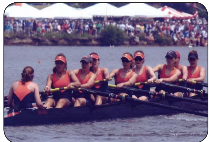
2007 Varsity Lightweight Eight just meters away from the National Championship.