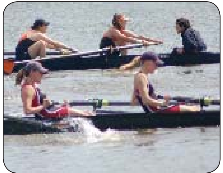
2007 2nd Varsity Eight rowing to victory over Penn.

To make it all happen, we need your help in the form of a donation. We have raised 35% of our ambitious goal of $150,000 for 2007-2008. Please see the back cover for a list of our needs as well as ways to give.