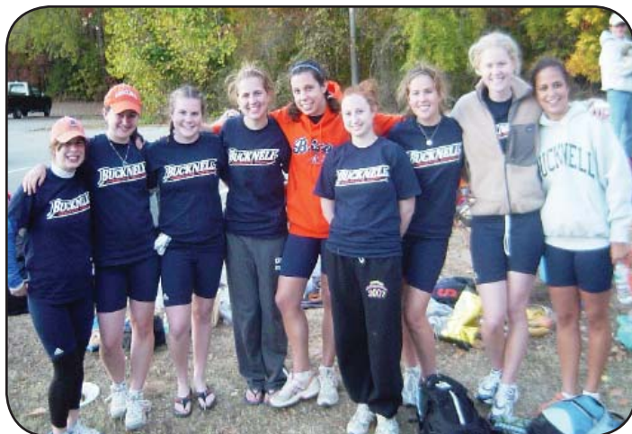
Above: A very competitive spring schedule, culminating in a foreign tour to England for the top twenty women on the team. Bottom: The Novice boat that finished 6th at the Head of the Occoquan poses for a group picture post-race.