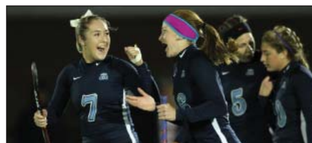
Old Dominion claimed a share of the regular-season title in its first season of BIG EAST play