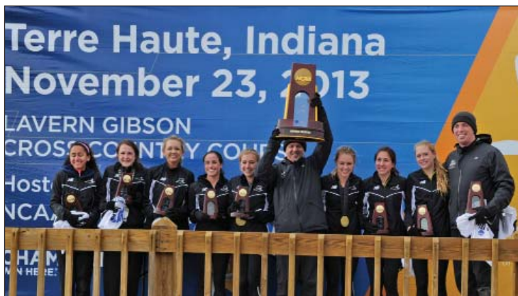
Providence College • 2013 NCAA Cross Country Champions

Along with the Bluejays and Friars, Villanova and Xavier earned NCAA Men's Basketball Tournament bids, while on the women's side, BIG EAST Tournament and regular-season champion DePaul punched its NCAA ticket, along with runner-up St. John's. The BIG EAST Women's Basketball Tournament was held for the first time at Allstate Arena in Rosemont, Ill., as the Blue Demons claimed their first tourney title in league history in front of a hometown crowd.