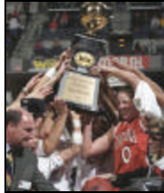
No. 5 seed Indiana completed its fairy-tale run by defeating top-seeded Purdue and No. 2 seed Penn State in the finals for the 2002 Tournament title.

On March 4, 2002 , No. 5 Indiana became the highest seeded team to win the Big Ten Tournament Championship, after knocking off second-seeded and regular season League Champion Penn State, 75-72. It was a historic and truly emotional moment for the Hoosiers as they knocked off the Lady Lions after upsetting top-seeded Purdue in the semifinals, 55-41.