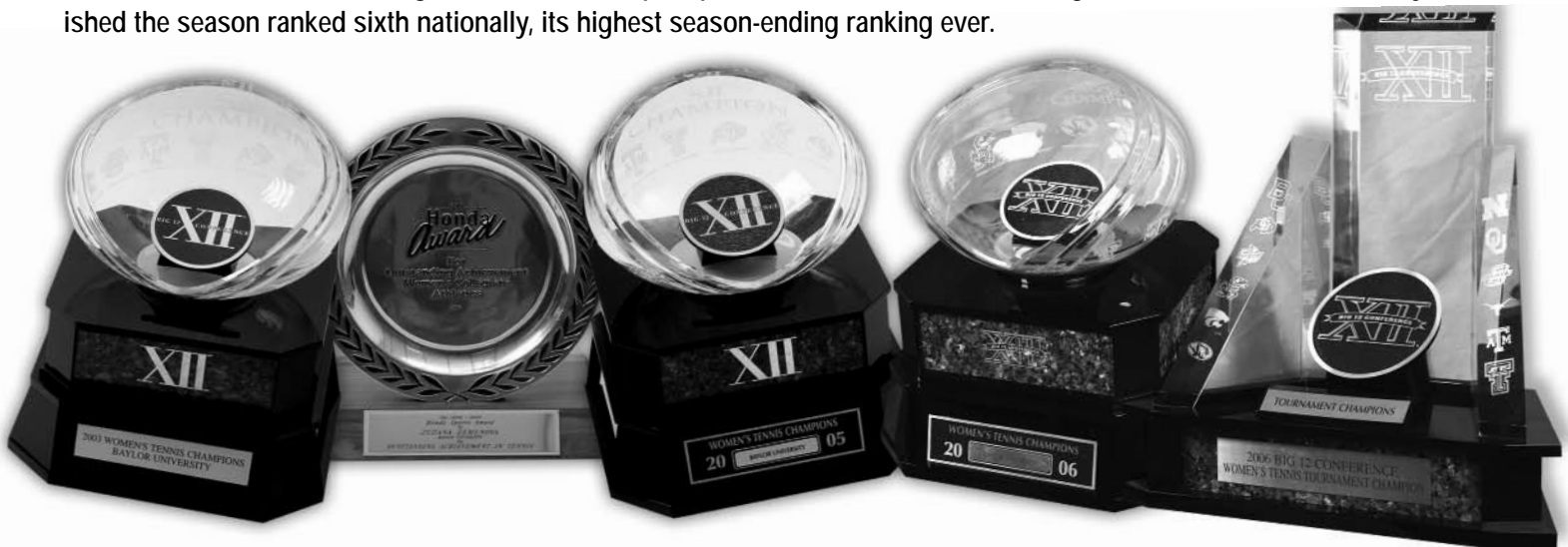
BIG 12 CHAMPIONS 2003

After hosting the NCAA Regional tournament, Baylor traveled to the NCAA Championships in Palo Alto, Calif., where the Bears advanced to the Elite Eight round, their deepest postseason run ever. After falling to fourth-ranked Florida, Baylor finished the season ranked sixth nationally, its highest season-ending ranking ever.