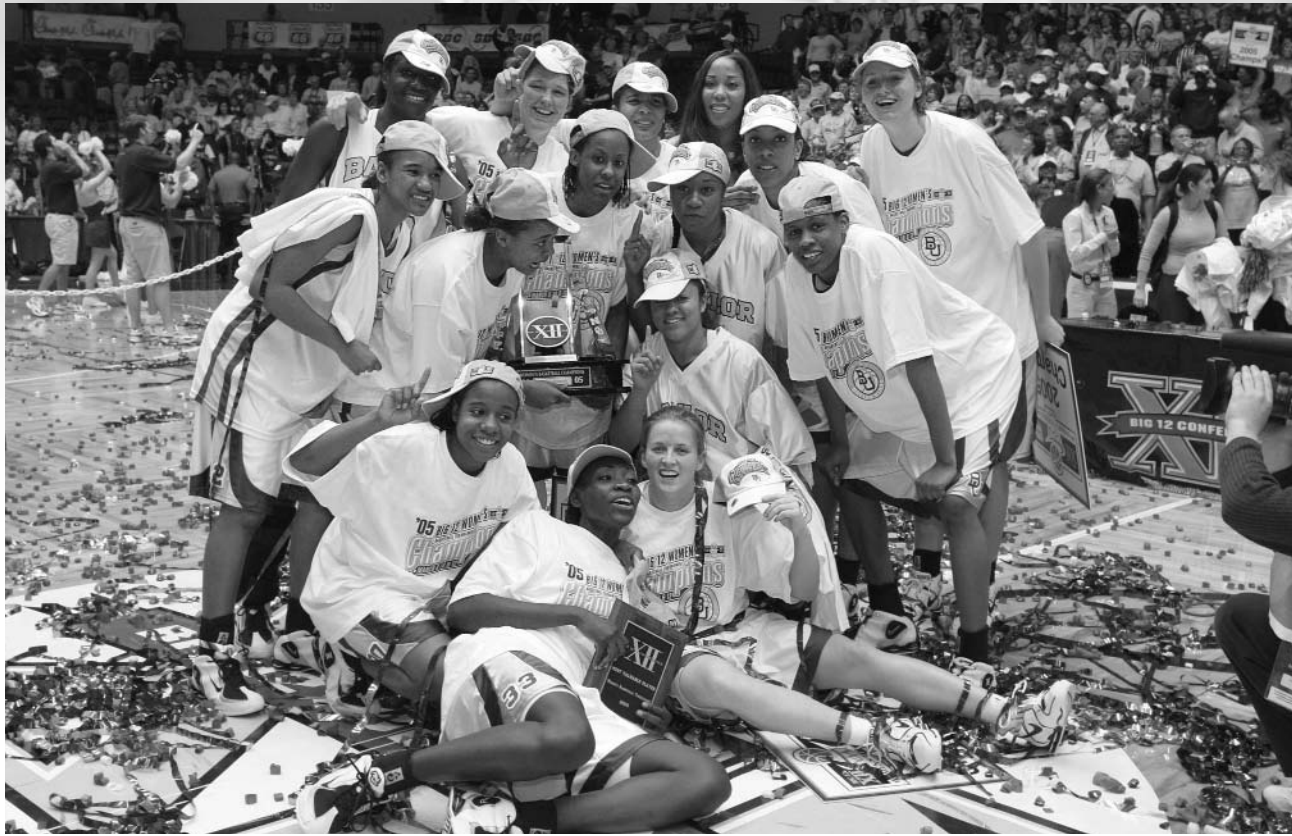
2004-05 Big 12 Tournament Champions