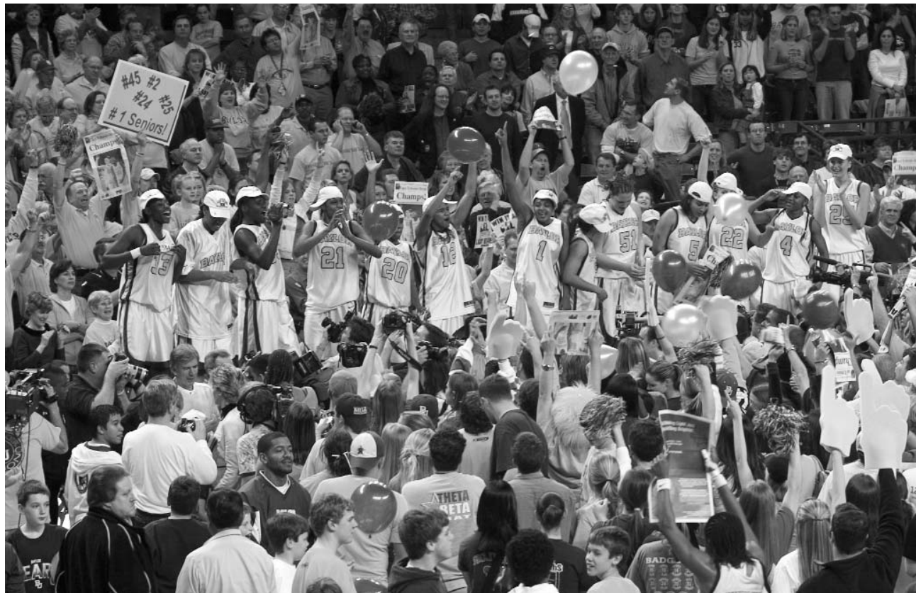
2004-05 Big 12 Regular Season Champions