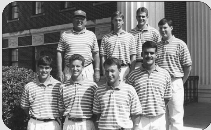
The 1992-93 team advanced to the NCAA Regional in Columbus, Ohio.