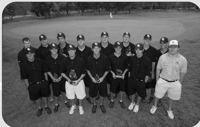
The 2005-06 team recorded four victories, including the Baylor Invitational.