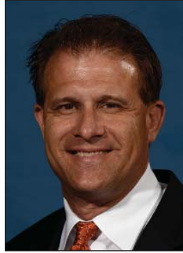
Gus Malzahn Head Coach