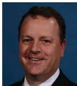
Tim Horton Running Backs