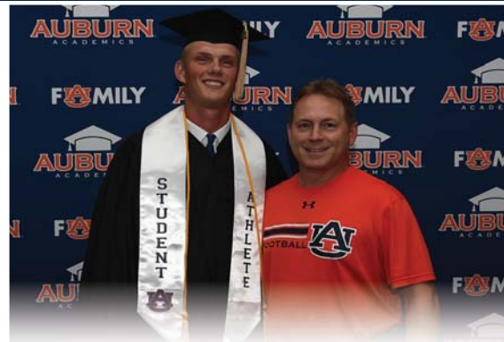
STUDENT-ATHLETE EXPERIENCE: ACADEMICS