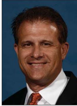
Gus Malzahn Head Coach