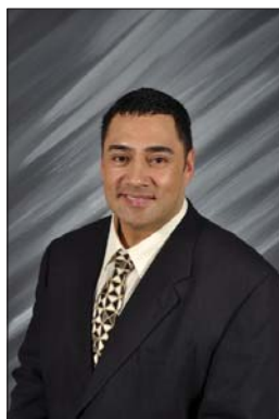
TIGHT ENDS AL PUPUNU