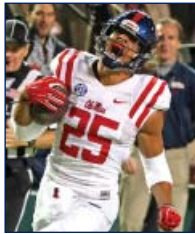
◀ WHITE TOP/ RED TRIM/ WHITE PANTS