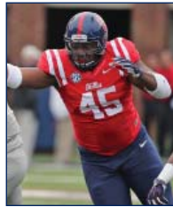
◀ RED TOP/ NAVY PANTS