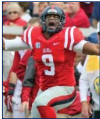
◀ RED TOP/ GRAY PANTS