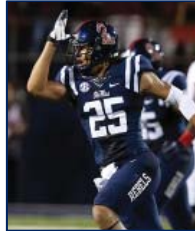
◀ NAVY TOP/ NAVY PANTS