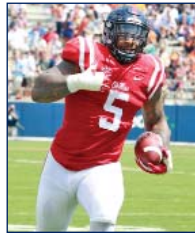
◀ RED TOP/ WHITE PANTS