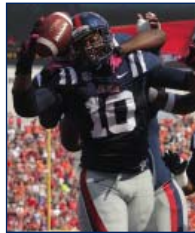
◀ NAVY TOP/ GRAY PANTS