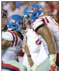
◀ POWDER BLUE HELMETS