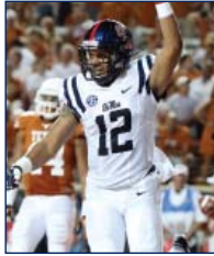
◀ WHITE TOP/ NAVY TRIM/ WHITE PANTS