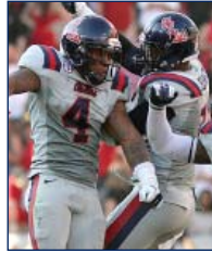
◀ GRAY TOP/ GRAY PANTS