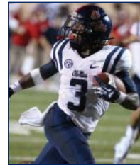
◀ WHITE TOP/ NAVY TRIM/ NAVY PANTS