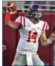
◀ WHITE TOP/ RED TRIM/ GRAY PANTS