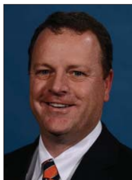
TIM HORTON RUNNING BACKS