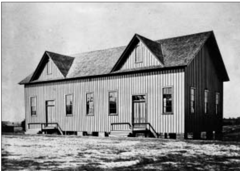
The First Gymnasium

Auburn Basketball has had four home arenas in its first 100-years: The Gymnasium (1906-1916), Alumni Gym (1916-48), the Sports Arena (1948-69) and Memorial Coliseum, now Beard-Eaves-Memorial Coliseum, (1969 to Present). And, back in the early years, even an outdoor court.