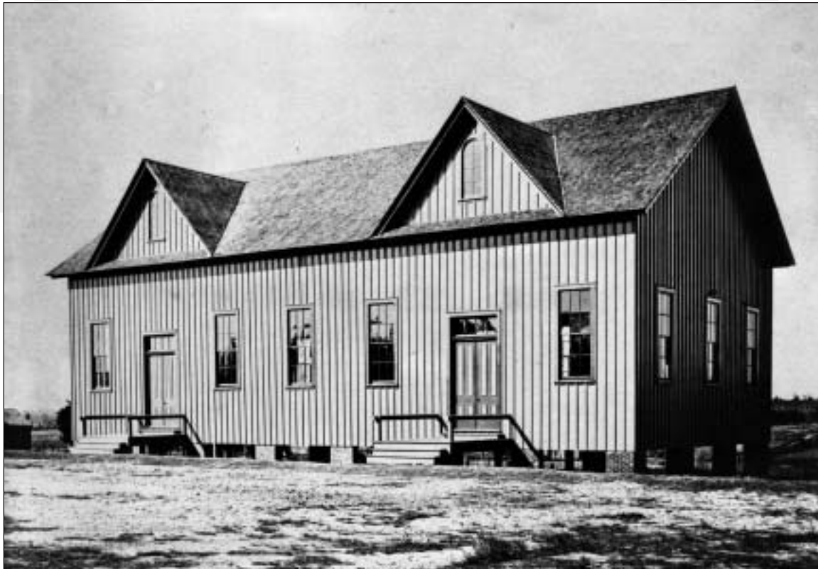
Auburn's First Gymnasium