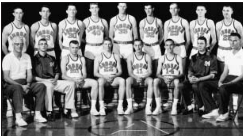
1960 SEC Champions

Auburn's best record during the Golden Era was 20-2 in 1958-59. The Tigers won 30 straight games and rose to No. 2 in the nation before losing to Kentucky and