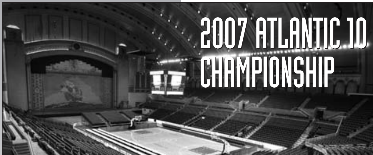
Boardwalk Hall, Atlantic City, NJ

The 31st annual Atlantic 10 Men's Basketball Championship returns to the East Coast as the league will hold its 2007 and 2008 championships at Boardwalk Hall in Atlantic City, NJ.