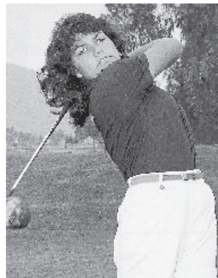
The late Heather Farr (1983-85) is one of 13 women's golfers inducted into Arizona State's Hall of Fame.