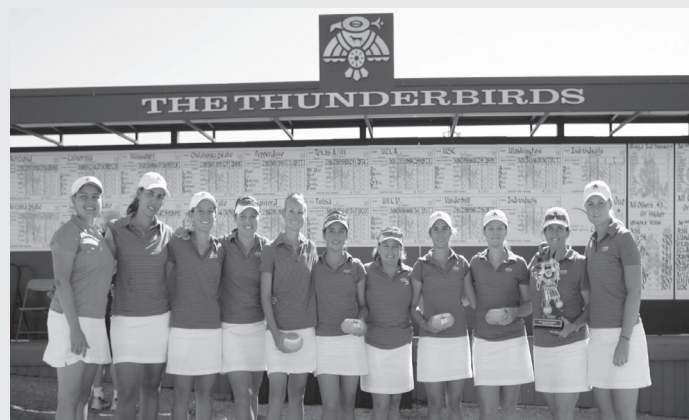
The PING/ASU Invitational has become one of the most prestigious events in collegiate women's golf. In 2007, Arizona State won the PING/ASU Invitational for the 24th time in the 40-year history of the