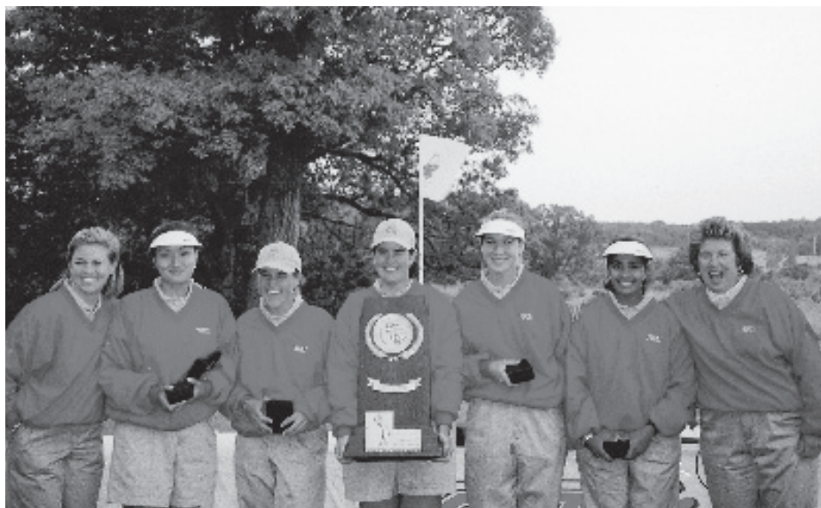
Arizona State captured its sixth NCAA title of the 1990's in 1998, taking the crown in dominating fashion with an 18-stroke lead.