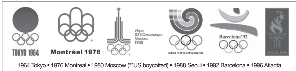
1964 Tokyo • 1976 Montreal • 1980 Moscow (**US boycotted) • 1988 Seoul • 1992 Barcelona • 1996 Atlanta