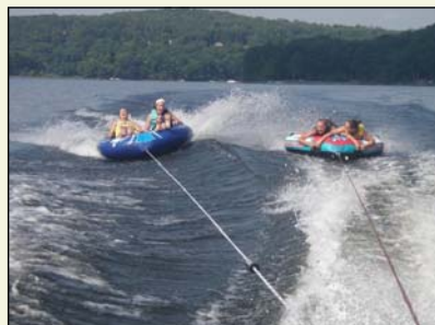
Players enjoy an afternoon of water tubing during PIAD during summer time at West Point.