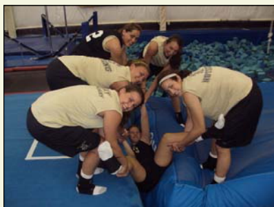
Players workout at the Gross Gymnastics Center during PIAD at West Point.