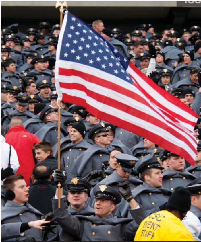
THE PAGENTRY OF THE ARMY-NAVY GAME HELPS MAKE IT ONE OF THE MOST ANTICIPATED EVENTS OF THE COLLEGE FOOTBALL SEASON.