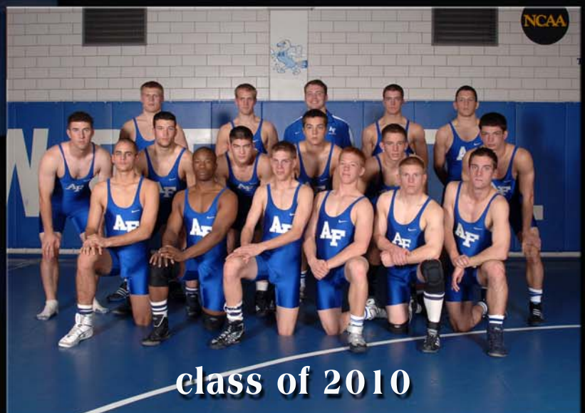
class of 2010