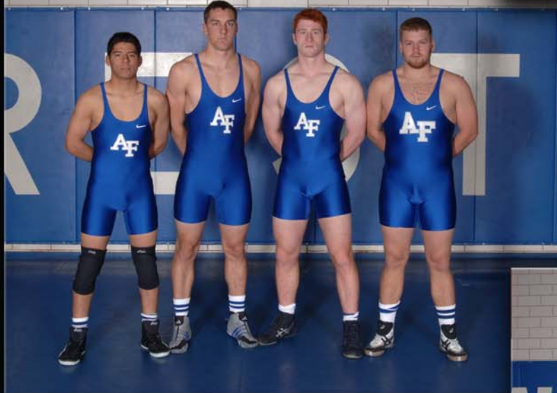
class of 2009