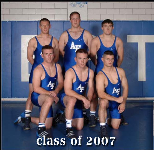
class of 2007