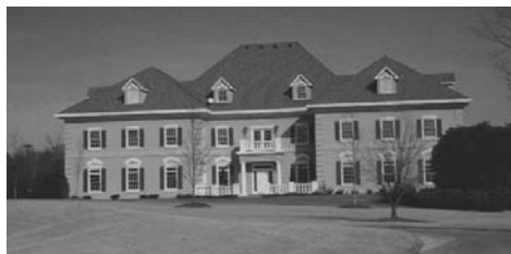
Atlantic Coast Conference 4512 Weybridge Lane, Greensboro, N.C.