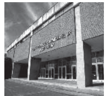
North Carolina Carmichael Auditorium 8,010