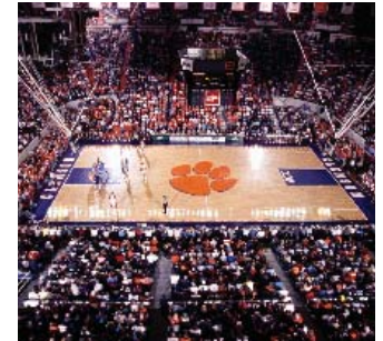
Clemson Littlejohn Coliseum 9,850