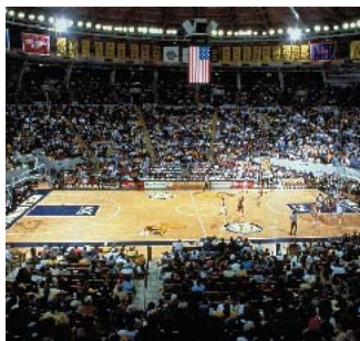
Georgia Tech Alexander Memorial Coliseum 9,191