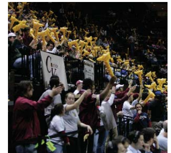
Florida State The Tucker Center 12,100