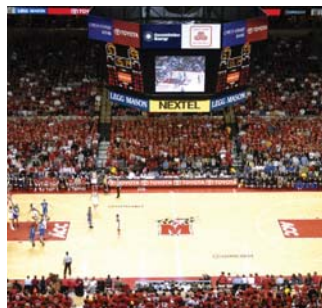
Maryland Comcast Center 17,950