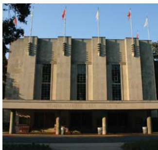
NC State Reynolds Coliseum 9,500