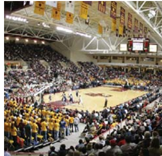
Boston College Silvio O. Conte Forum 8,606