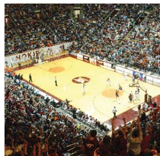
Virginia Tech Cassell Coliseum 9,847