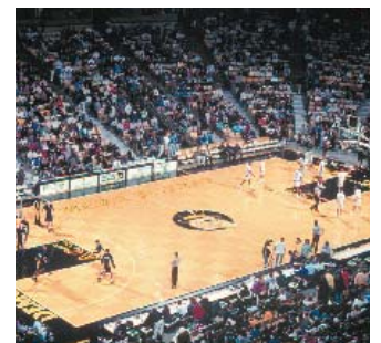
Wake Forest Lawrence Joel Memorial Coliseum 14,407