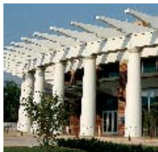
Virginia John Paul Jones Arena 15,000