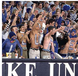
Duke Cameron Indoor Stadium 9,314