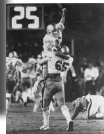
Doug Flutie Boston College