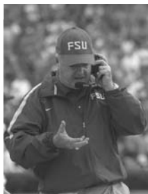
Bobby Bowden Florida State